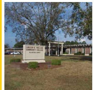
Lurleen B. Wallace Community College

“.... [T]he goals of Alabama State University Library’s Information Literacy Program: to enable students, faculty and staff to locate, evaluate, and use information effectively and ethically.”