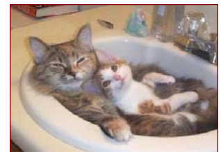
Thankful for family, friends, and colleagues.

Thanksgiving with just the right amount of leftovers!